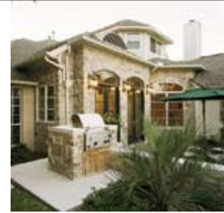
Moisan Remodeling, Inc. Residential Addition $100,000 to $250,000