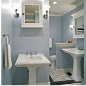
D&D Services Remodeling Specialists Bath under $30,000

Congratulations to three local members for becoming National CotY Winners at the Evening of Excellence during the NARI National Spring Board Meetings. Congratulations also go out to fellow Region 5 national winner CG&S Design Build in Austin, TX for Entire House $250,000 to $500,000.