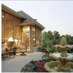
DSL Construction Inc. Residential Exterior Specialty